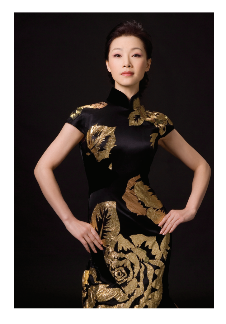
SATURDAY 11 AUGUST, 7.30PM £27.50-£10